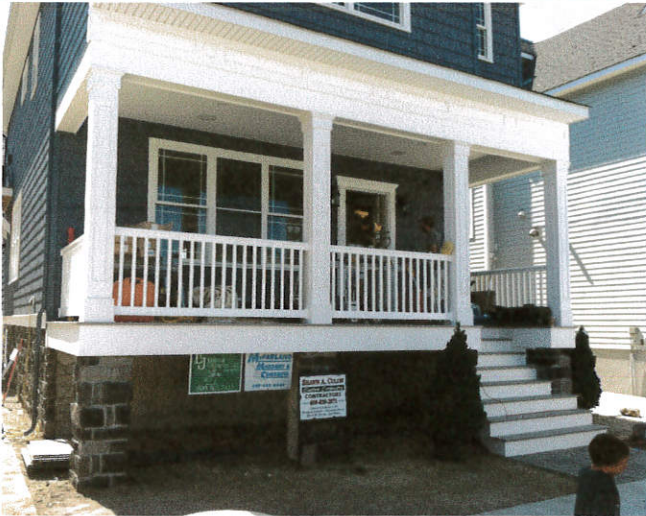
Front View Date Taken: 08/29/2012