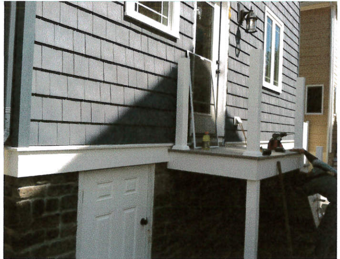
Rear View Date Taken: 08/29/2012